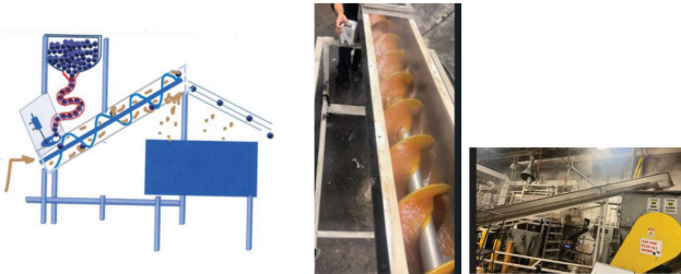
Figure 3: (Left) Illustration of speed-controlled auger, steel ball feeding device, grease holding tank, and steel balls and (Right) photo of a 15 ft auger used in production

The use of solid media for cooling to replace water cooling has shown success in reducing the grease temperature by as much as 100°C in under 30 minutes with minimal mixing. This has also resulted in more stable grease, less shearing and in the case of aluminum complex grease a significant increase in yield.