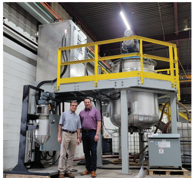
Figure 1: Patterson Kettle Microwave-Operated.

A paper presented at the NLGI Annual Meeting 2013, documented the time and energy savings of processing grease in the ranges of 40-50% total savings. Widespread use of this concept over time, will result in a more sustainable grease processing than the current technologies.