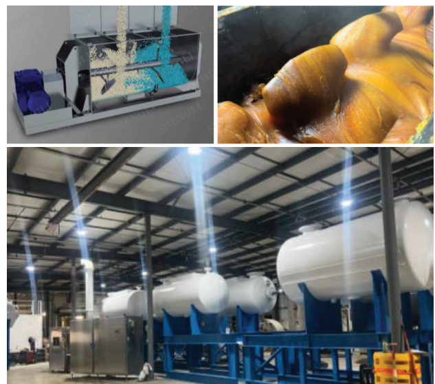
Figure 5: Paddle Blenders for Blending granular materials, Aluminum Complex Grease on Paddles, and Horizontal Mixers designed specifically for blending grease

To mix solids like construction aggregate, different colour plastic pellets and the like, horizontal mixers are employed. Also called blenders, they include different designs such as ribbon blenders or paddle blenders. Experiments with thick greases have shown that paddle mixers present a more effective option for mixing. Paddle blenders use opposing paddles with different angles that act like a row on a rowboat. The outer paddles push the grease to one direction while the inside paddles push the grease the opposite direction creating an efficient mixing action. Additionally, since the mix tanks is usually not 100% full, the paddles lift the grease during half of the rotation, but the grease drops off the paddle surface due to gravity when the paddle are near vertical position. Horizontal blenders do occupy more floor space than vertical tanks do. But, for finishing grease especially when small amounts of additives or dye are to be mixed, they reduce mixing time, reduce shear in shear unstable greases and result in energy and time savings.