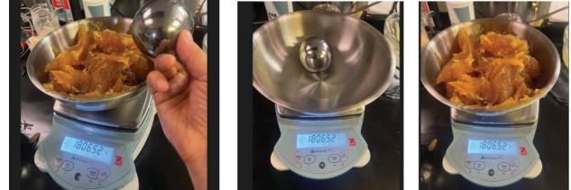
Figure 2: Volume comparisons for a 3" diameter steel ball and equal mass of grease

Research has shown that relative to many solids, water is not an effective absorber of heat. For example, a 3" diameter steel ball would weigh 1.6Kg and would take up about 20% as much space as 1.6Kg of water (Figure 2).